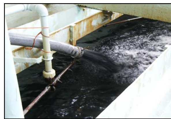
GAC being applied to the filter bed via water slurry.