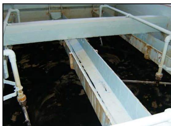
Filter ready for new GAC to a depth of 22-24 inches. The expended carbon has been removed.

DRINKING WATER PROJECTS : Seven filters, for final treatment of water, are located within the Water Plant. The filter bed consists of granular activated carbon (GAC) and sand, with a supporting layer of gravel. Every three years the GAC is replaced, as its ability to adsorb contaminants diminishes. This event occurred in the first week of June 2011.