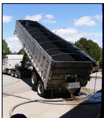
Truck off loading GAC in a water slurry.